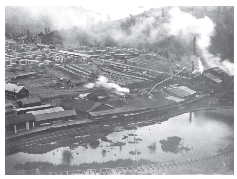
Two views odf the sawmill at Perry, 1920s