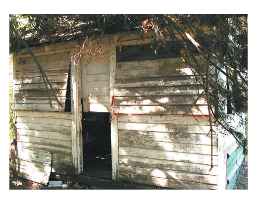
Former ticket booth at Pine Cone swimming pool, now converted for child's playhouse on Slack's property, 2002