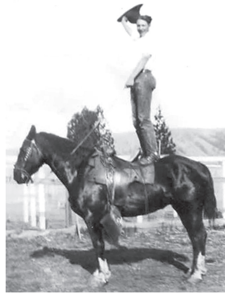
Duck, at age sixteen, demonstrating his ability with horses