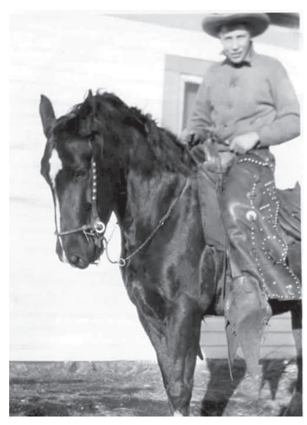
Duck in chaps bought from a Wild West show