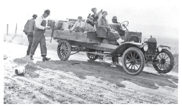
Slack family makes a trip from La Grande to Pendleton in chain-driven Model-T Ford truck --with aid of wooden plugs and rolled oats to stop radiator leaks, 1918

We came back by Tollgate. There'd been an old road up over there for years. It wasn't much of a road, if I remember right. My dad had worked on the road that goes to Tollgate from Elgin. He was using a team and a scraper on that road, building a right of way. I helped run them; they're hard work. They had a handle on the back that the guy that was helping had