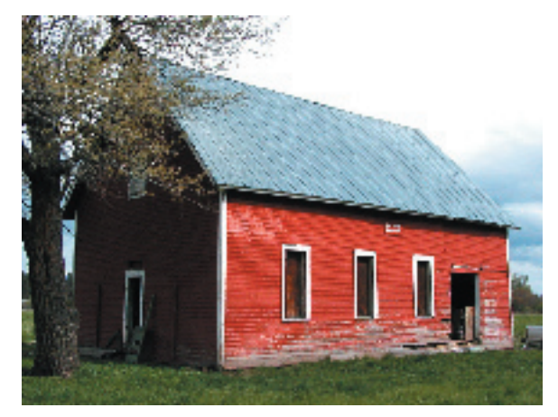
Dry Creek School, 2002