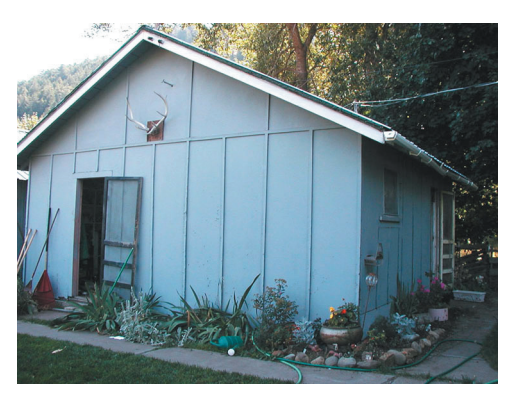
Former cabin at Pine Cone Auto Camp, now converted for storage on Slack's property, 2002