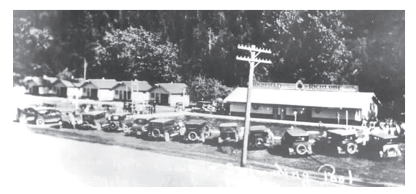
Pine Cone Auto Camp & Swimming Pool, 1930s